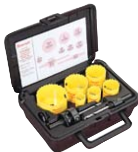
Starrett® No. KV1094 Electricians' Hole Saw Kit